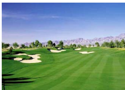
Primm Valley Lakes Course