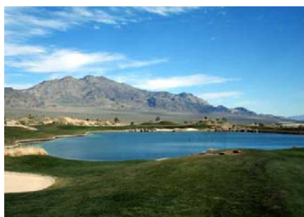
Paiute Sun Mountain Course